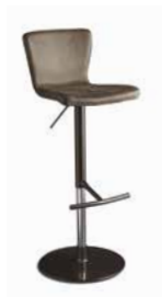
CHAIR: Rap p. 54